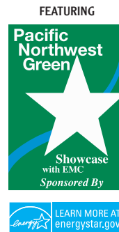
EXHIBIT SPACE RESERVATION FORM

PRESENTED BY: Association of Energy Engineers