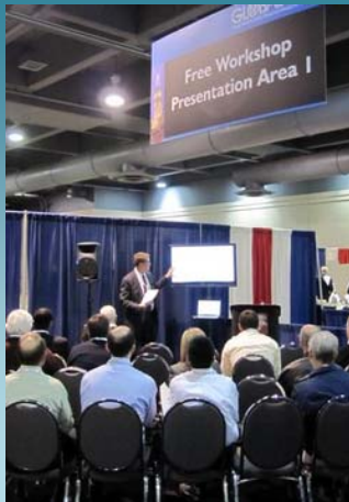
EXHIBIT HALL WORKSHOP SPONSOR: $2500 per Workshop Area

Logo on Large Workshop Signage (Includes Hanging Signs & Workshop Event Boards), Logo & Sponsor Recognition within the show marketing materials, signage, etc. The workshops are presented by exhibitors showcasing success stories, problem solving, technology integration, and retrofit/new construction considerations. Presentations run both days in both Presentation Areas throughout the expo hours listed. Please note: The workshops are held in two Presentation Areas, sponsorship for these is on a first-come, first-serve basis.